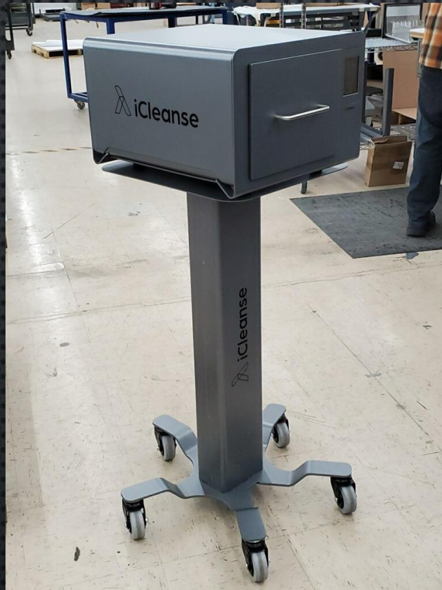
Mobile stand (iCleanse Mini)