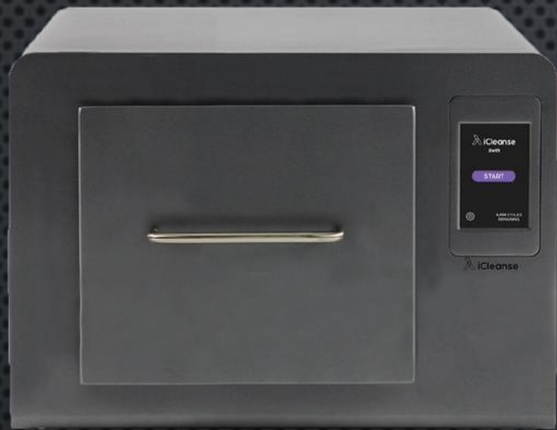
iCleanse Swift Mini