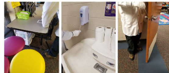
Figure 1. Surfaces in classrooms, a nurse's station, the cafeteria, hallways, and restrooms were swabbed to quantify bacteria, yeast and mold levels before and after sanitization and disinfection with the Clorox® Total 360® System. Examples of sites swabbed are shown above.

The goal of this study was to examine the impact of the Clorox® Total 360® electrostatic sprayer system on environmental cleanliness in an elementary school in the Broken Arrow Public School system. The school used the Clorox® Total 360® System daily throughout the 2019 school year (SY19). Environmental swabbing of a variety of surfaces in the school showed that the Clorox® Total 360® System reduced bacteria, yeast and mold levels to near zero, including on hard to clean surfaces like door handles.