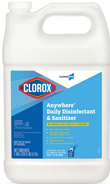
T360 128 oz

Confidently disinfect and sanitize hard surfaces that come in contact with food, people, and pets.